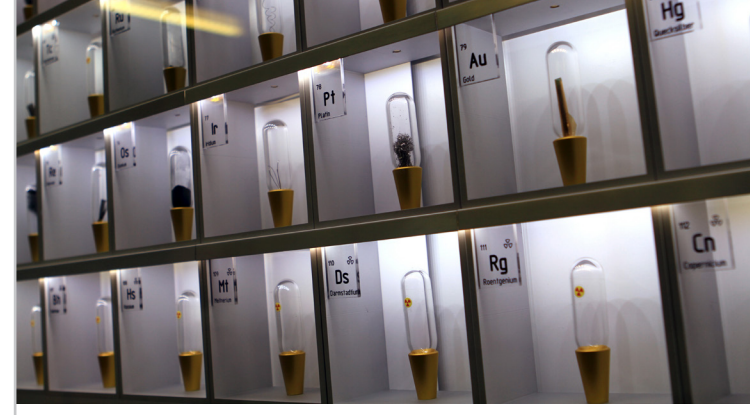
Periodic Table in the foyer of the Faculty of Chemistry and Pharmacy.

Abbreviation: L = Lecture, S = Seminar, Ex = Exercise, LC = Lab Course, Inorg. Chem. = Inorganic Chemistry, Org. Chem. = Organic Chemistry, WS = winter semester (October - March), SS = summer semester (April - September), ECTS = European Credit Transfer System